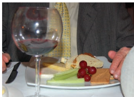
A plate of excellent local cheeses