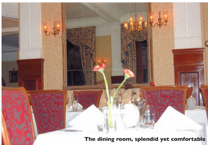
The dining room, splendid yet comfortable