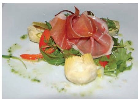
Prosciutto, artichoke and sweet pepper salad

Many of the rooms and public areas at Chilworth Manor are named after distinguished men and women. The Dorothy L Sayers room is so-called because the upper-crust crime writer, creator of Lord Peter Wimsey, was related to one-time owners of the Manor, which may have been the setting for one of her country-house murder mysteries. GK Chesterton was a visitor here as, it is thought, was his friend Hilaire Belloc. Dwight D Eisenhower has his room, too – it is said he stayed at Chilworth Manor while planning Operation Overlord in 1944.